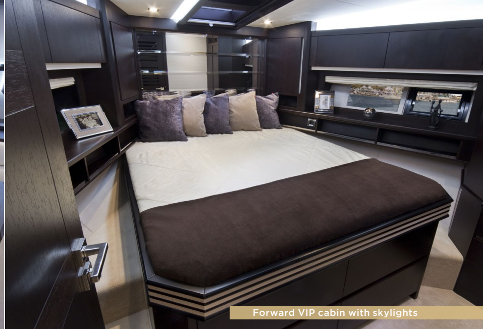
Forward VIP cabin with skylights