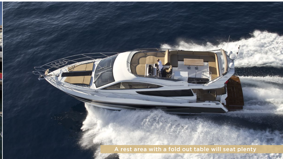
A rest area with a fold out table will seat plenty

The coherent layout has allowed for an unprecedented amount of space on all three decks, while maintaining a classy and appealing presence. Outside, the spacious flybridge will surely be the center of attention with its massive sundeck, functional bar area and a dining table with seating for eight guests. The aft cockpit and salon are divided by retractable glass doors and share a wet bar area.