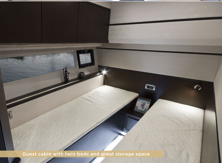
Guest cabin with twin beds and great storage space