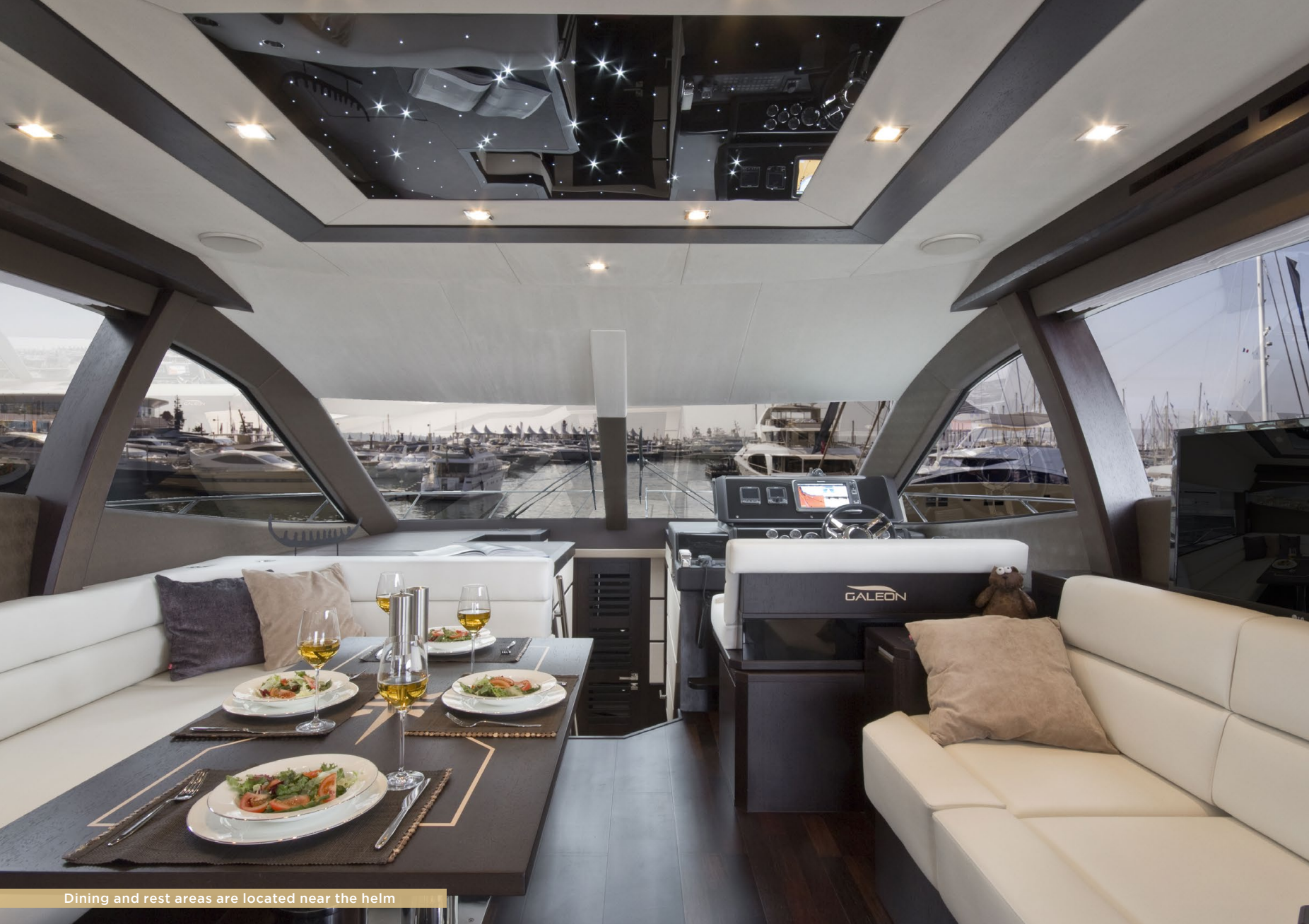
Dining and rest areas are located near the helm