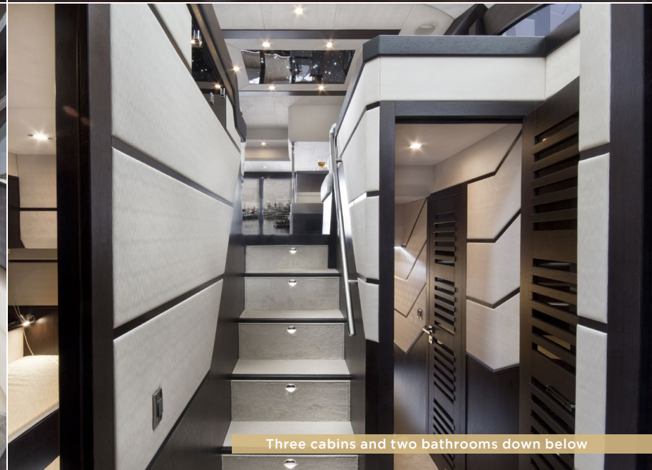
Three cabins and two bathrooms down below