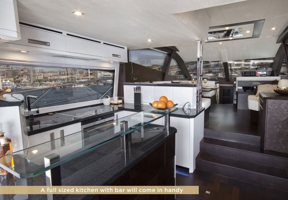
A full sized kitchen with bar will come in handy