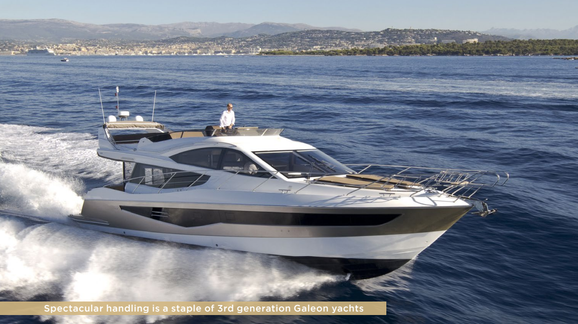
Spectacular handling is a staple of 3rd generation Galeon yachts