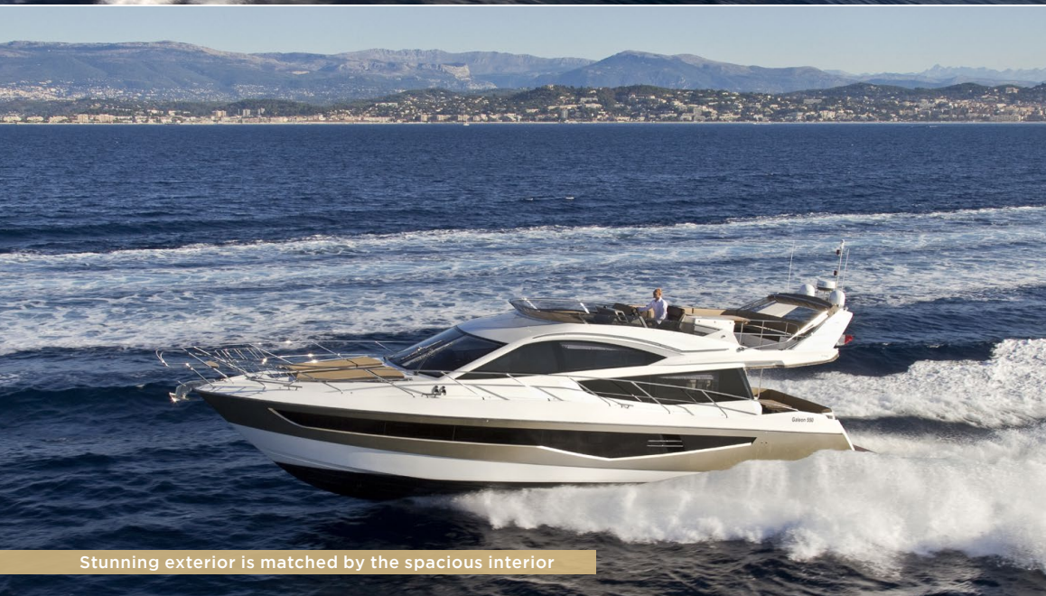
Stunning exterior is matched by the spacious interior