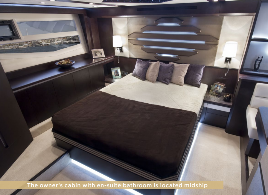
The owner's cabin with en-suite bathroom is located midship