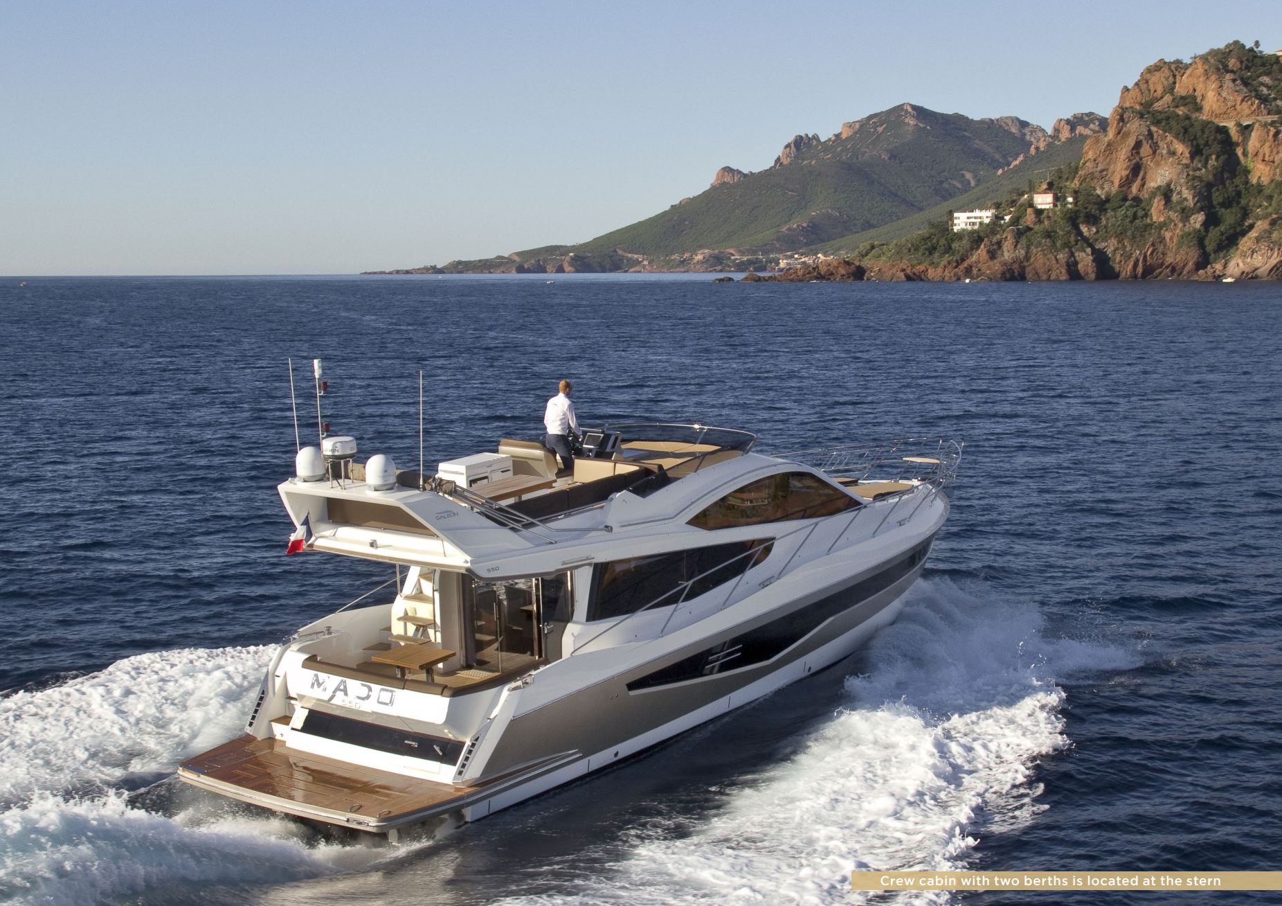
Crew cabin with two berths is located at the stern