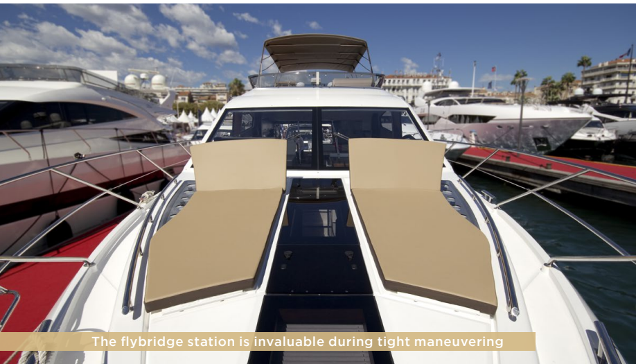
The flybridge station is invaluable during tight maneuvering

Galeon 550 Fly is bound to turn heads in amazement with its clever and luxurious interior on par with the dynamic exterior.