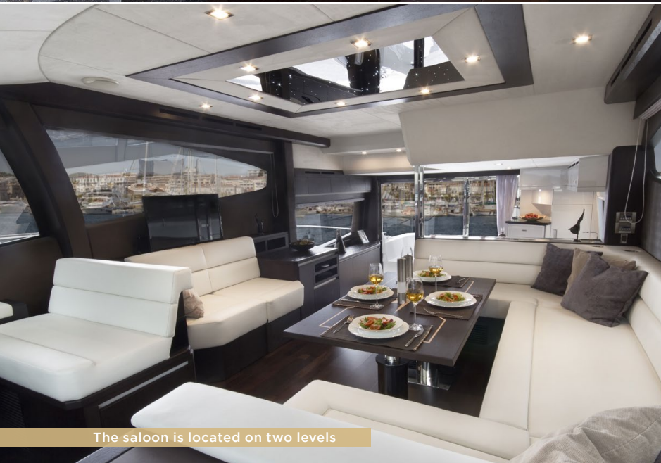
The saloon is located on two levels