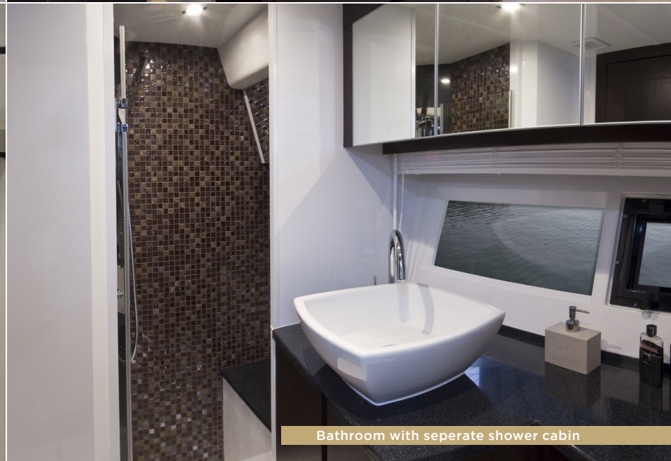
Bathroom with separate shower cabin