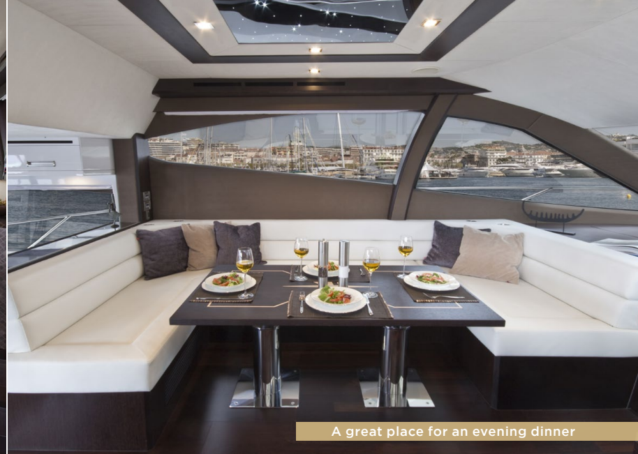
A great place for an evening dinner